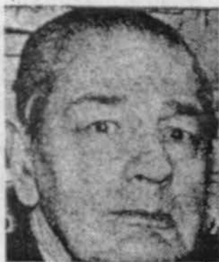
Lord Clancarty: "It's a Whitehall cover-up"

sightings over Britain between 1978 and 1981.